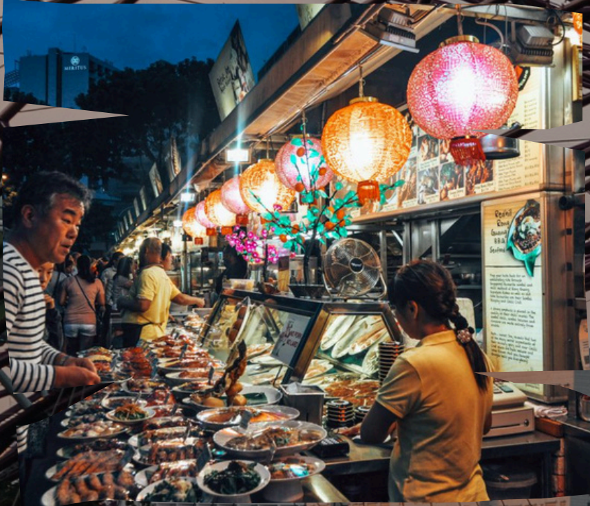
STREET FOOD & CULTURE