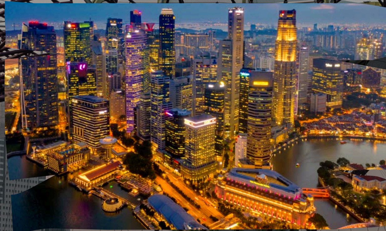
VIEW THE CITY