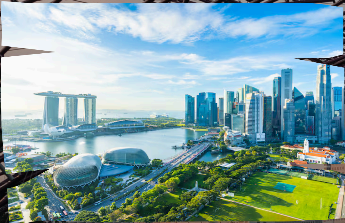
VIEW THE CITY