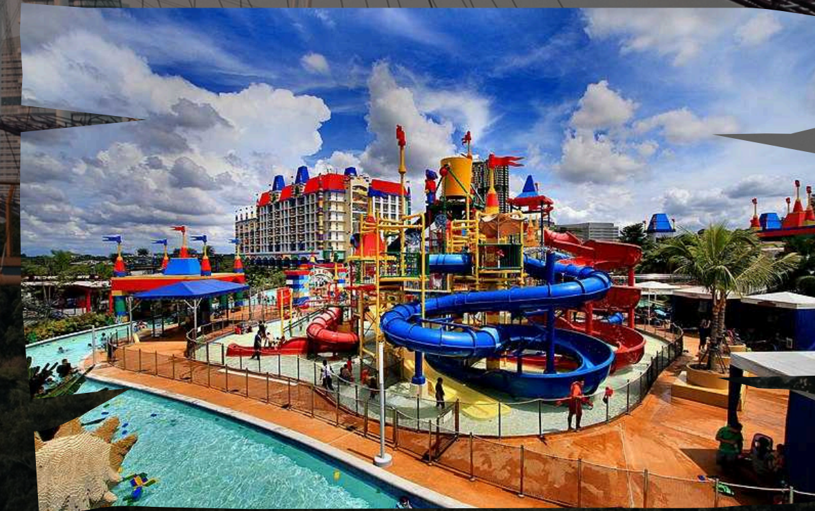
THRILLS & AMUSEMENT