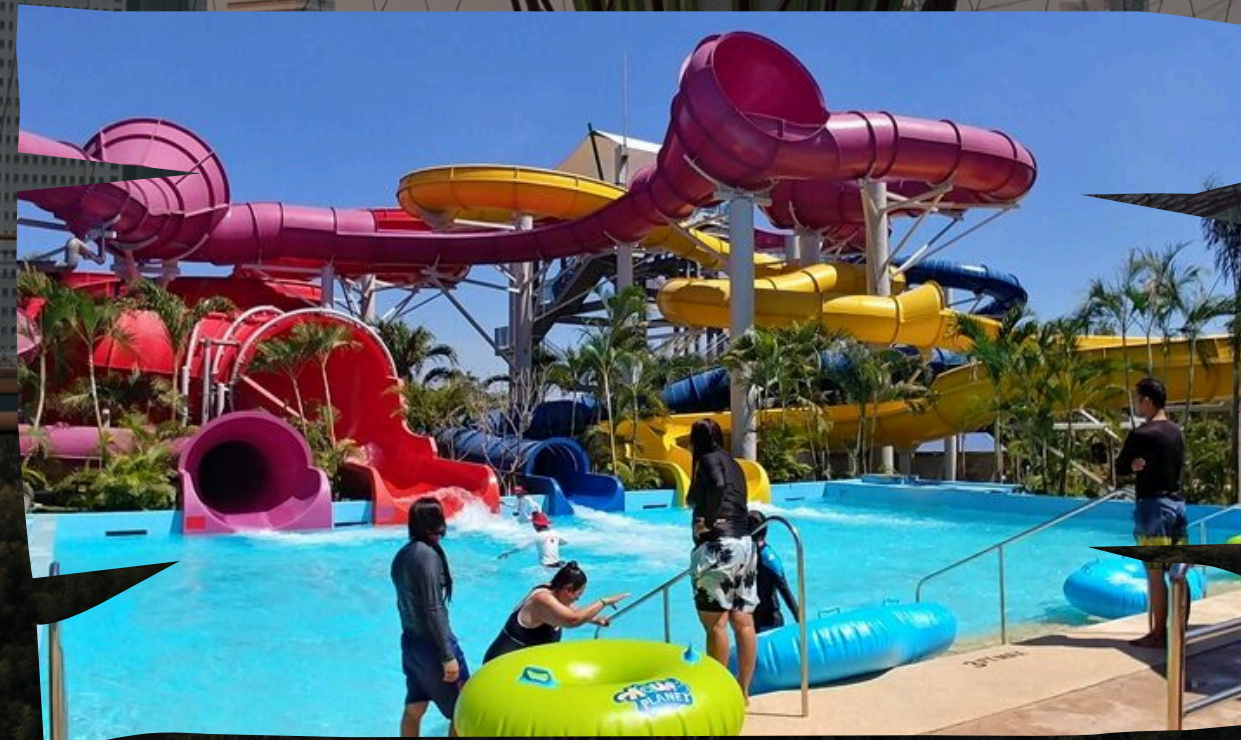
THRILLS & AMUSEMENT