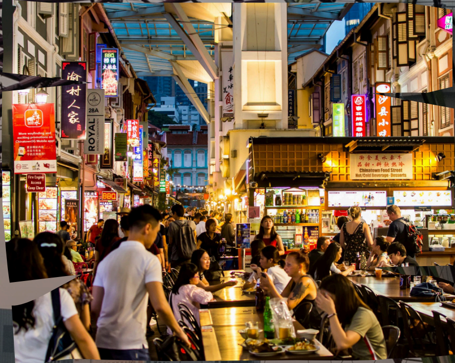
STREET FOOD & CULTURE